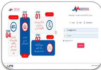
After signing we will give a portal for ICAP employees & members