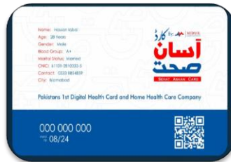
a digital card is creadt instantly after registration