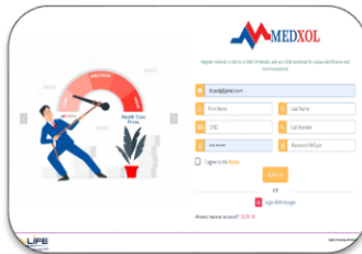
From there all employees & members get register there selves and later there families including ( Parients, Spuse & Childrens)