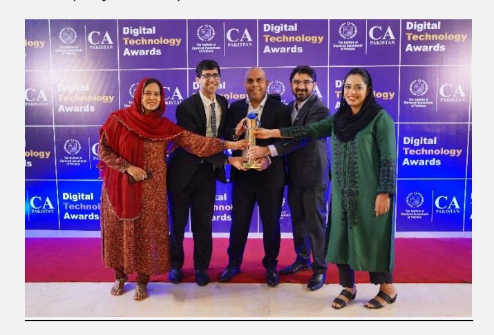
Winner: Meezan Bank Ltd

A panel discussion was organized, featuring the award-winning individuals who shared the challenges and obstacles they encountered during their projects' implementation.