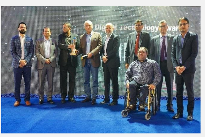
Winner: Pakistan Petroleum Limited

A panel discussion was organized, featuring the award-winning individuals who shared the challenges and obstacles they encountered during their projects' implementation.