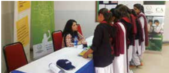
Students gathering information about CA

The City School PAF chapter organised an Education Expo PAFEX 2015 . Several educational institutions and ICAP benefitted by the expo. The campus hosted around 500 students along with their counsellors and principals. A few students showed interest in the profession of CA and inquired about the exemptions available after A levels.