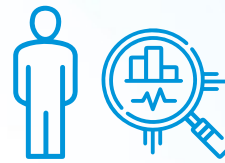
Self and business assessments