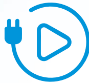
Immediately applicable use of 'plug and play' tools