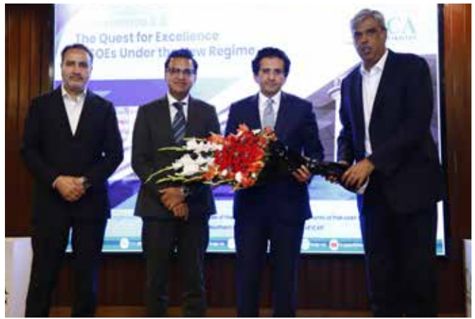
Seminar on the SOE Law