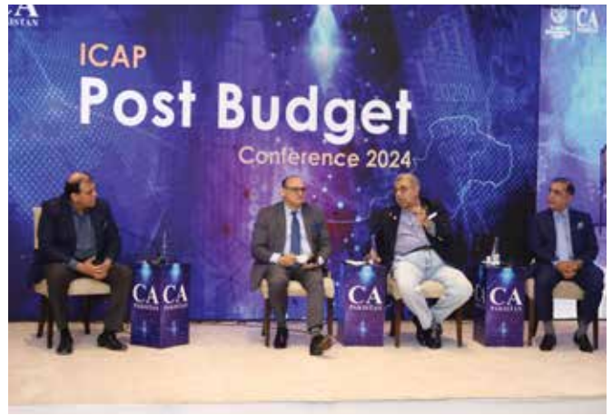
Post Budget Conference