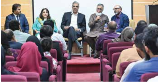
President RAET Visit