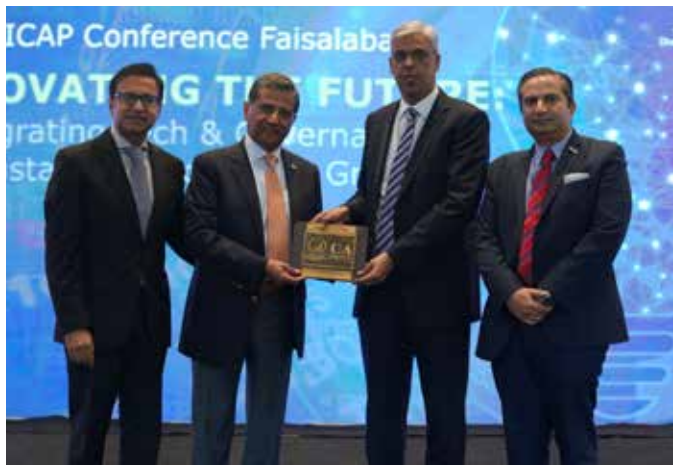
Innovating The Future Integrating Technology & Governance for Sustainable Economic Growth