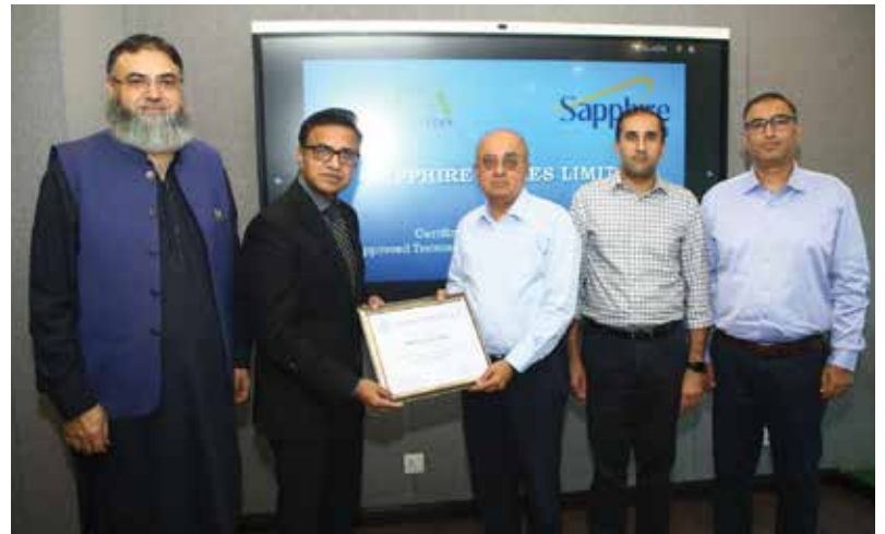
Sapphire Textiles Limited-TOoP Signing