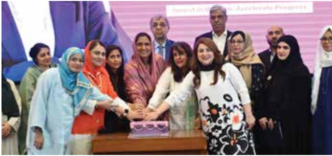
CA Womens Day