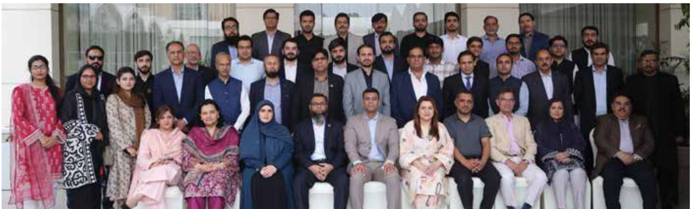
Masterclass Sustainability Islamabad