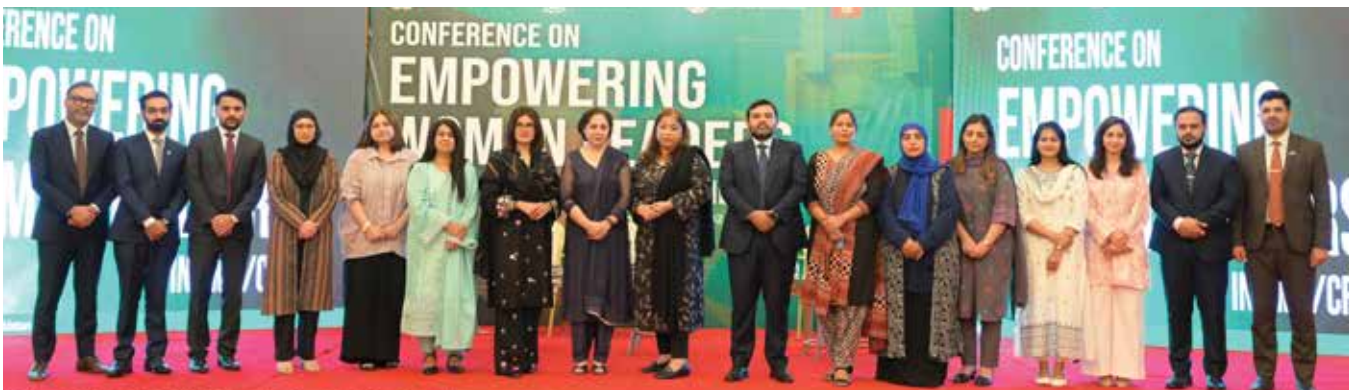
Conference on Women Empowering