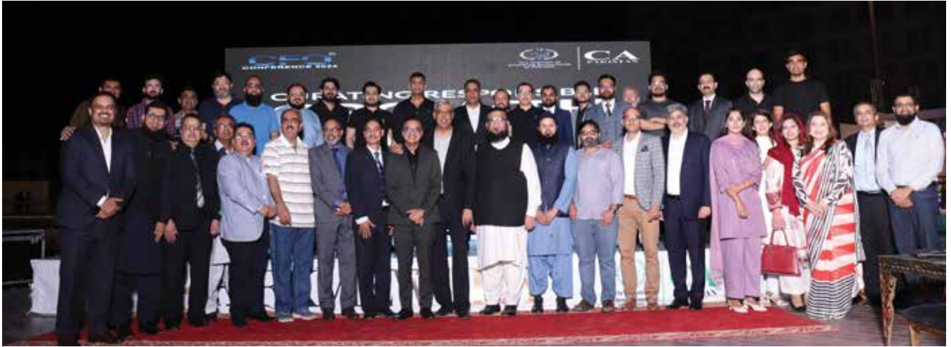
CFO Annual Dinner Islamabad