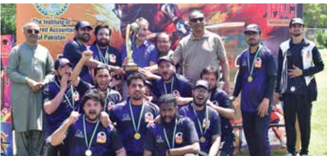
CASA North Annual Sports Gala