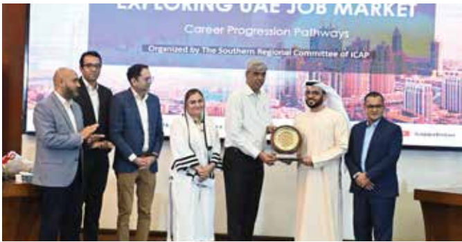
Session on Exploring on UAE Job Market