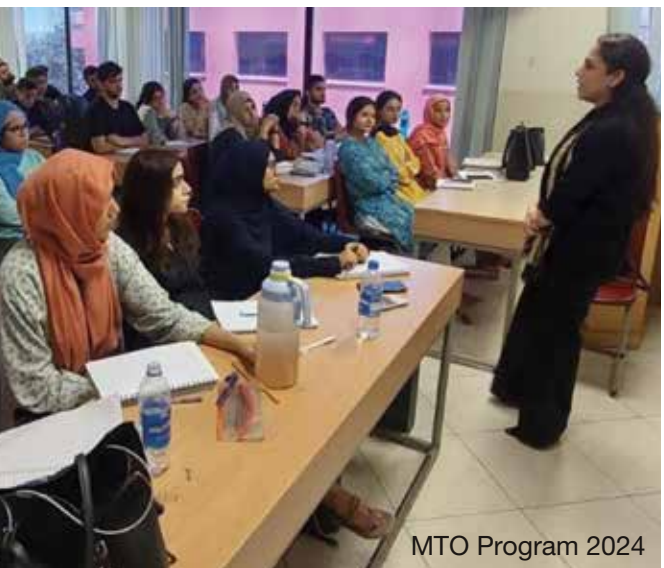
MTO Program 2024