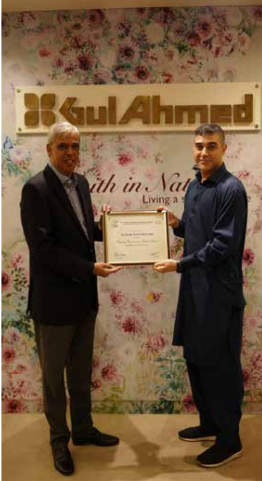
GulAhmed Textile Mills Limited-TOoP Signing