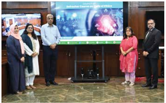
Launch of Refresher Course of Code of Ethics