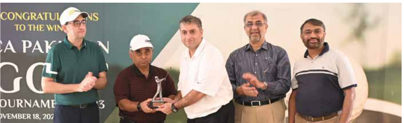
CA Pakistan Golf Tournament 2023