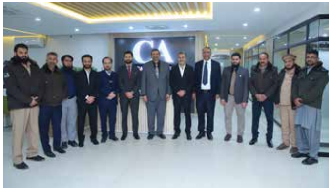
Peshawar Office Inauguration