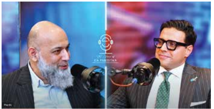
Voice of CA Pakistan