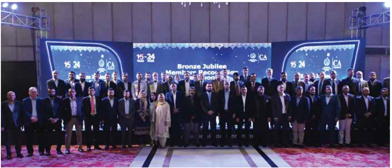
Members Recognition Ceremony