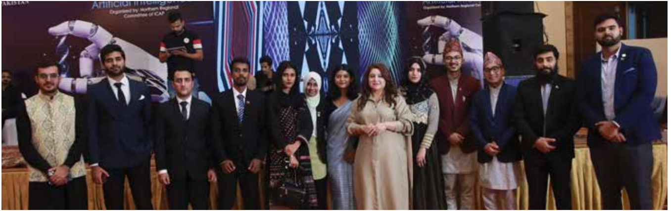
ICAP International Student Conference Embracing Artificial Intelligence