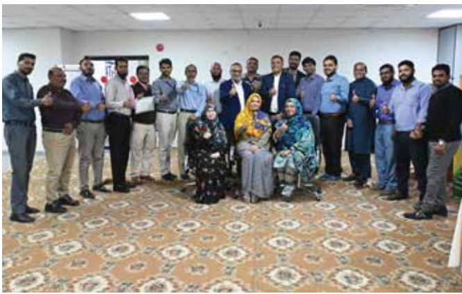
In-House Training on How to be a Great Team Player