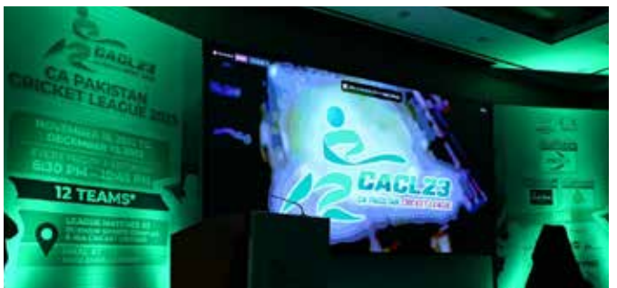
CA Pakistan Cricket League 2023