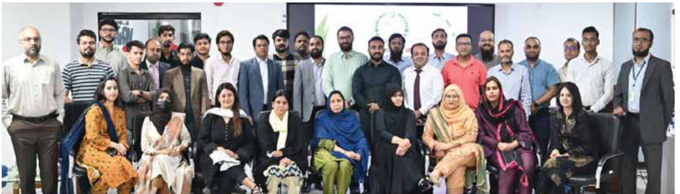
CA Counsellors Roundtable