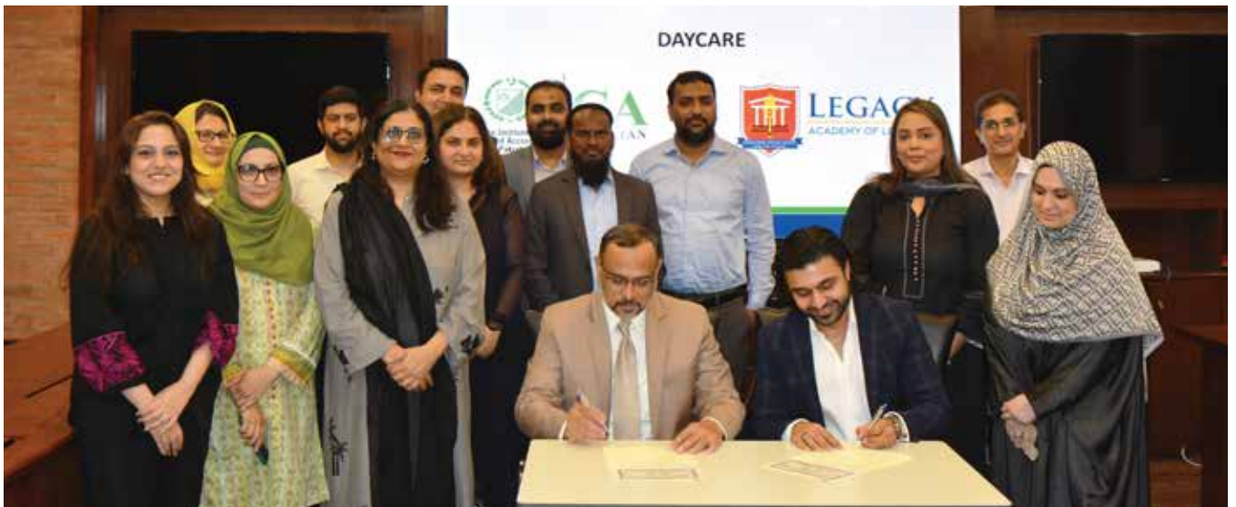
MoU signing with Legacy Academy of Learning (Daycare)