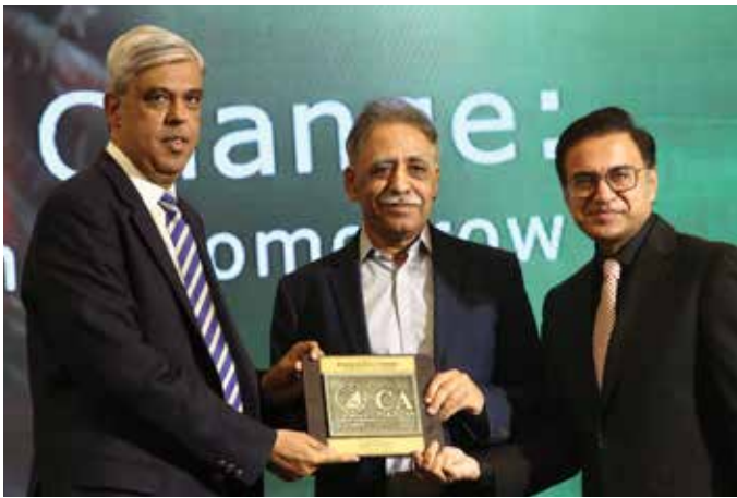
Conference on Driving Economic Change