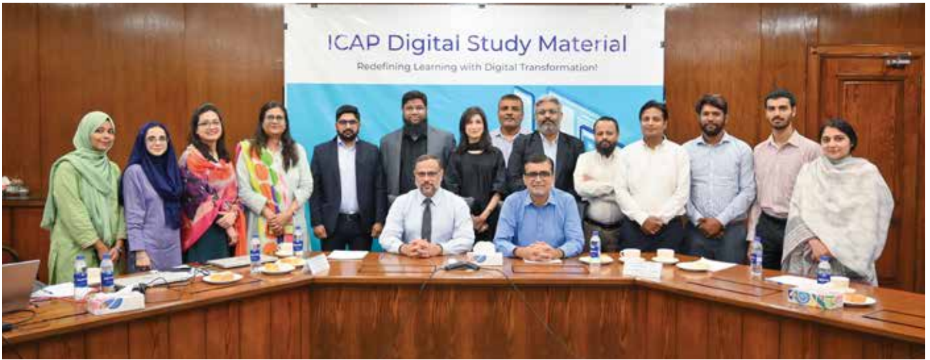
Digital Study Material Launch