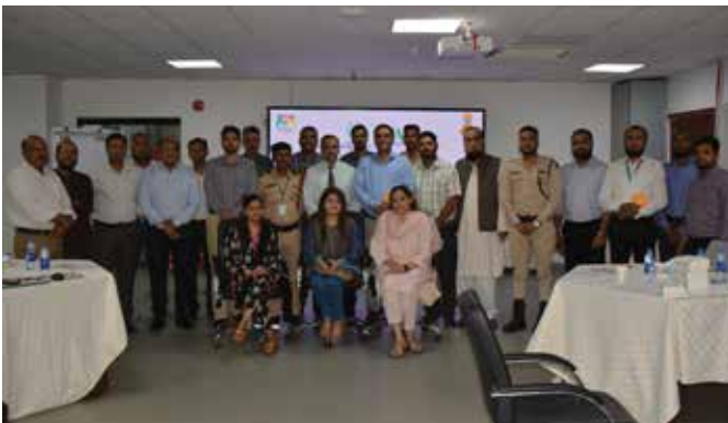
Fire & Safety Training