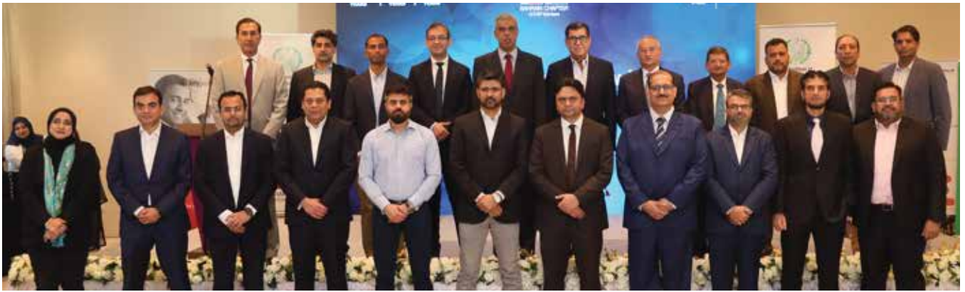
Bahrain Chapter ICAP-Annual Dinner-Grove Resort Amwaj Island