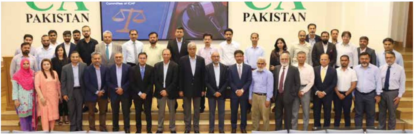
Tax Laws (Amendment) Act 2024 - Lahore