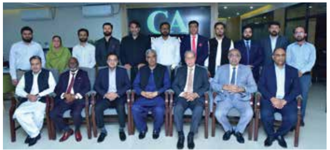
President meetup with Practicing Members Peshawar