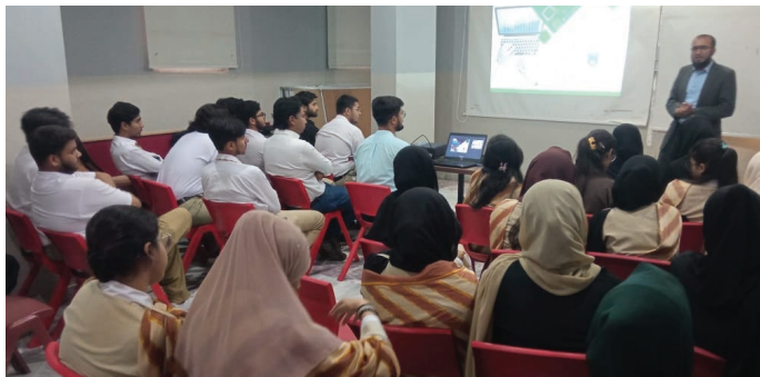
Concordia College, Saima Arabian Villas, North Karachi Campus.