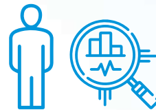
Self and business assessments