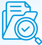
Case studies and role plays